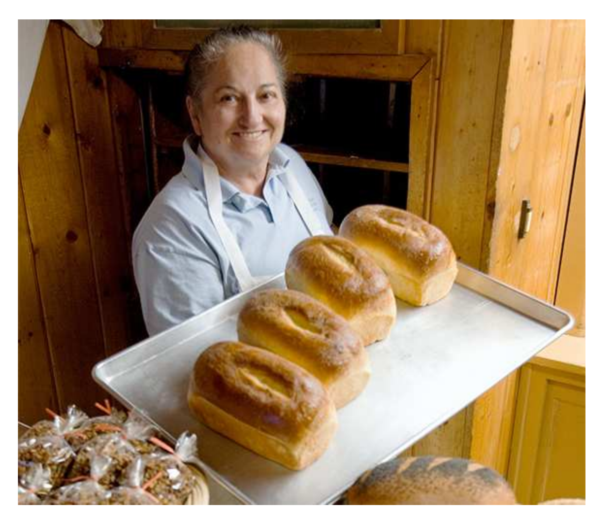
Top\ photo: Tabor\ Hill\ Winery\ \&\ Restaurant.